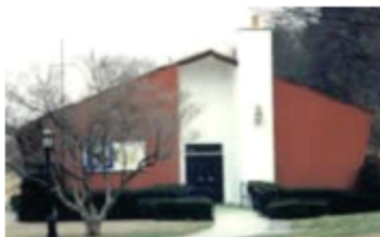
St. Francis Xavier Church 808 Main Street, Bolton, MA