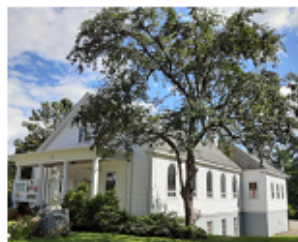
ACORN Tree & Landscaping, Inc.