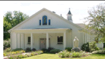
St. Theresa, The Little Flower Church 17 Still River Road, Harvard, MA

FIND US AT FLOCKNOTE htpboltonharvard.flocknote.com ADD: mail@flocknote.com to your contacts.