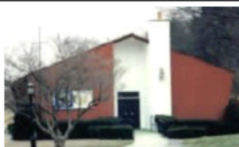
St. Francis Xavier Church 808 Main Street, Bolton, MA