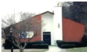
St. Francis Xavier Church 808 Main Street, Bolton, MA